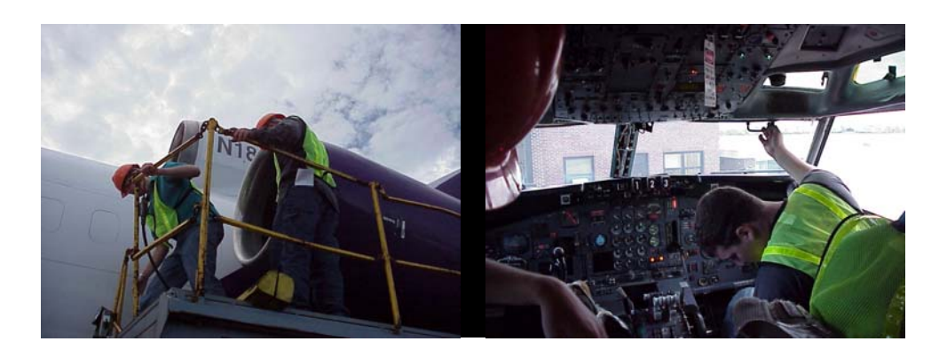
Figure 1: AT 402 Live Laboratory

To effectively implement and evaluate the use of industry-based SMS principles within an aviation technology laboratory curriculum, it was necessary to utilize a course that closely approximated an industry operation. As a senior level capstone course, AT 402, Aircraft Airworthiness Assurance, was an ideal candidate course. The course offered an intensive and challenging learning environment designed to challenge students' ability to incorporate management and technical skill sets within a realistic aircraft maintenance environment. The course utilizes Purdue University's two large transport aircrafts (Boeing 737 and Boeing 727) to simulate a large scale aircraft maintenance operation. Both aircrafts had fully functional engines and systems. While non-flying, these aircrafts offered an excellent simulation as live laboratory platforms for practicing industry standard maintenance procedures, as shown in Figure 1. In this class, senior students in the Aeronautical Technology Maintenance program learn to function as operations managers and team leaders, while simultaneously integrating the knowledge, skills, and abilities of technical aircraft maintenance practices acquired throughout the undergraduate Aviation Technology program. Students in AT 402 are tasked with researching, planning, and implementing a large aircraft production maintenance operation using the same tools, required safety equipment, and practices as those in the industry.