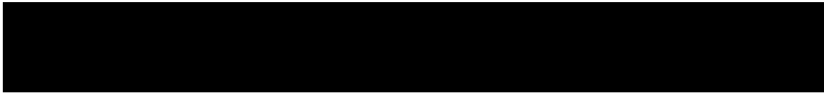
Table 2: SHNU Student Survey Results from In-class Design Exercise

The second design exercise was administered during a lecture in the Microprocessors II course. This assignment required the student to complete an assembly language program using an associated schematic and operational requirements document as a guide. The same questions from the first survey were asked after this design exercise, and the results can be seen in Table 2. Similar to the first survey results, 63 percent of the students had difficulty understanding how to start the design process, 26 percent had difficulty understanding the English instructions, and 37 percent had difficulty understanding the engineering requirements and circuit documentation.