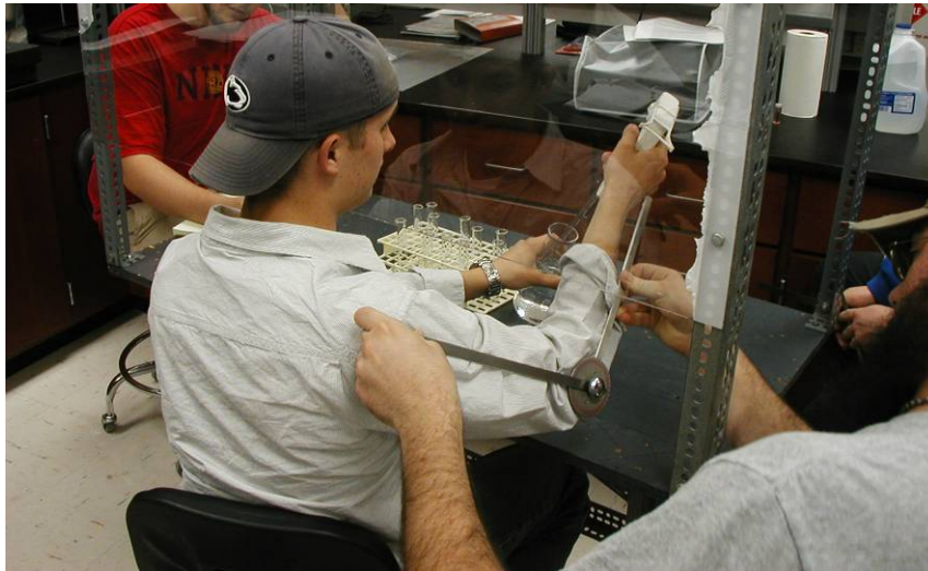
Figure 1: Measurement of Joint Angles Using Goniometry in the Mock BSC