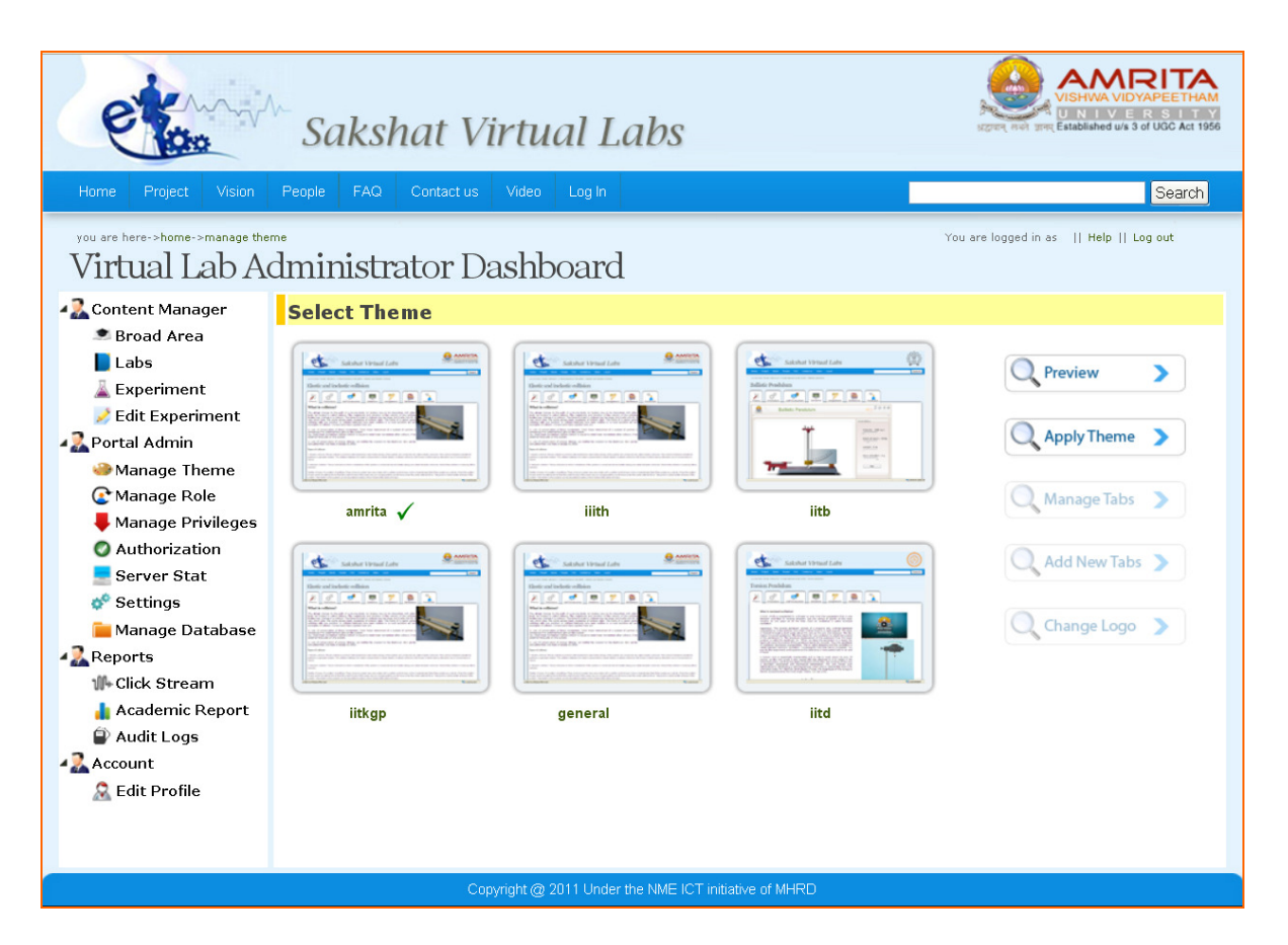
Figure 4: Pre configured set of templates and designs

Review comments between the author and developer may be exchanged using the VLCAP. Instructors may add their knowledge to a course without programming, while providing the storyboard to the animation artist or the requirements for a simulation to the software developer.