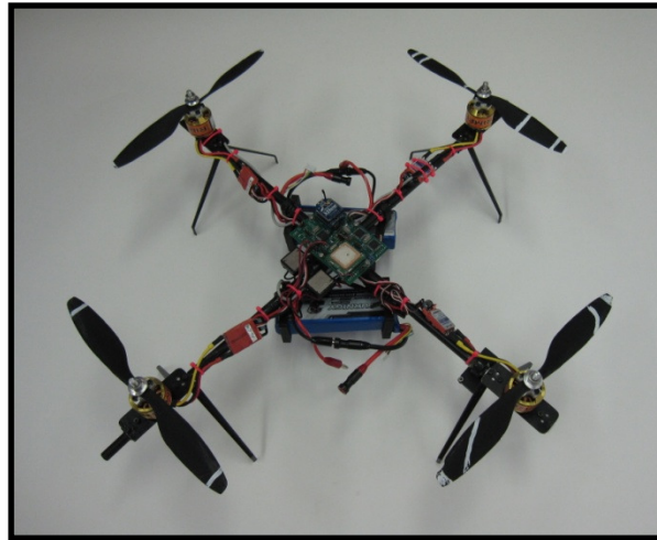
Figure 2: Quadrotor Aerial Structure with On-board Embedded Control

Mechanically, most of the structure is carbon fiber and those points that experience significant force are aluminum which include the center cross connection piece, the motor mounts, and the motor mount to carbon fiber connectors. On the outside of the motor mounts, a connection is available for a safety ring and a tether for test flights. This connector is made from ABS plastic as a sacrificial break point to prevent a catastrophic event requiring an entire airframe rebuild. Altogether the system weight is approximately two kilograms. Figure 2 is a picture of the current prototype.